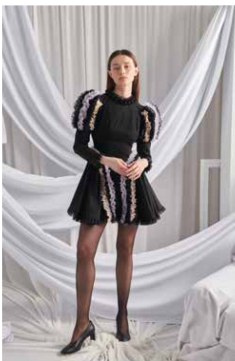
by Celia B